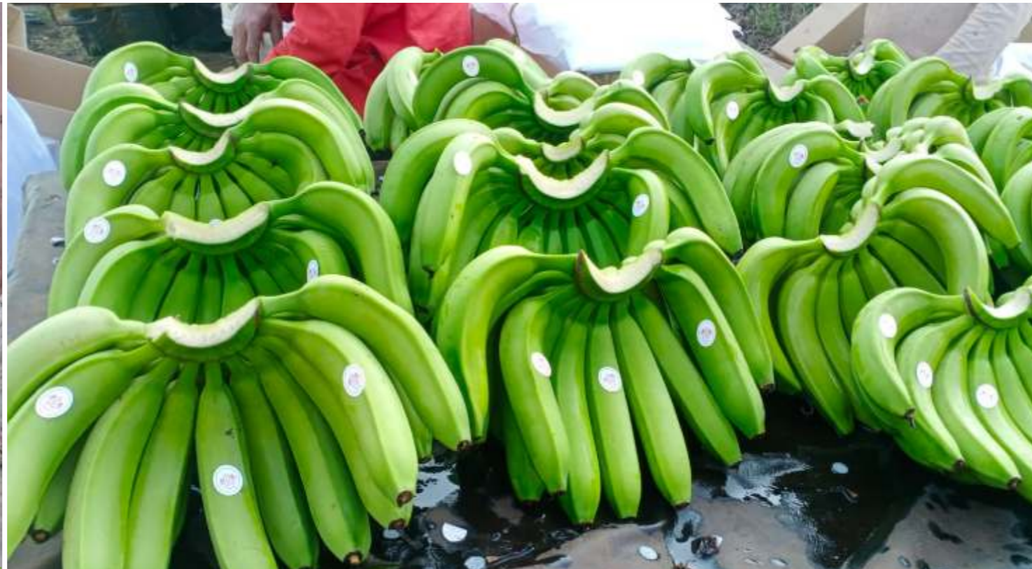
Excellent quality yield exported to Iran