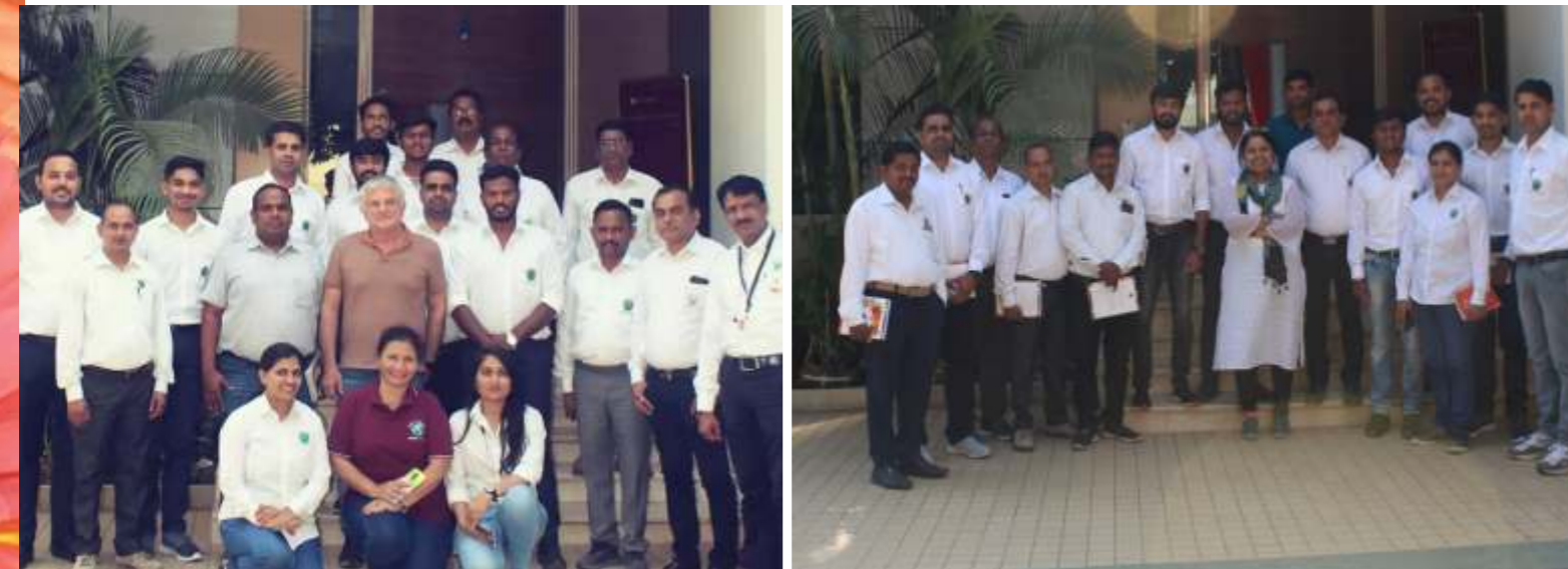
The team is ready to elevate sales and increase customer satisfaction with their innovative marketing strategies.