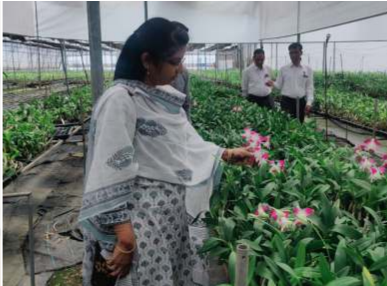
Technical training provided at Ethiopia