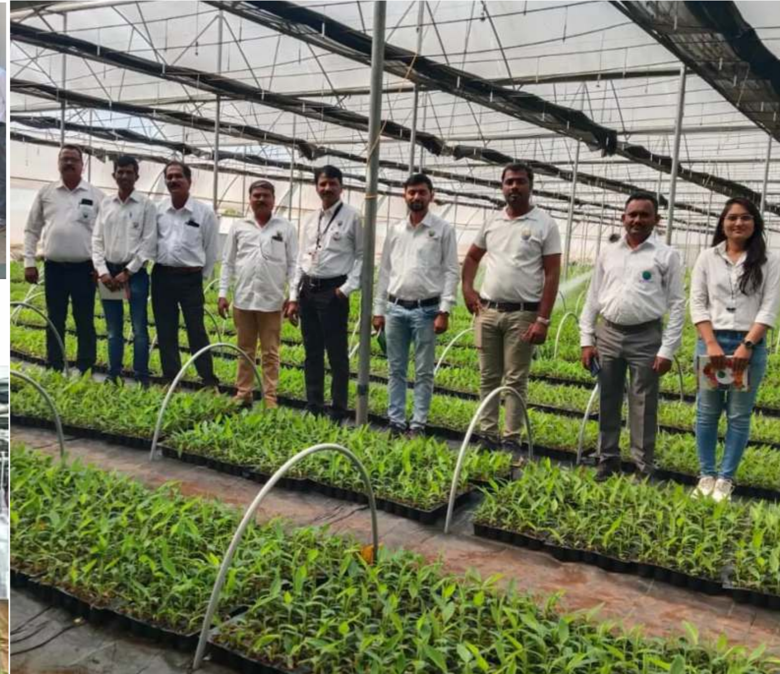
In an effort to maximize effectiveness and engagement, the team plans to build on existing campaigns, and focus on developing customer-friendly initiatives. Through successful implementation, the team is confident in their ability to reach the ambitious goals set for the New Financial Year.