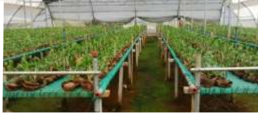
Cement Pole Stand

Temperature: Day temperature: 20 °C - 35 °C (Can go upto 42 °C)